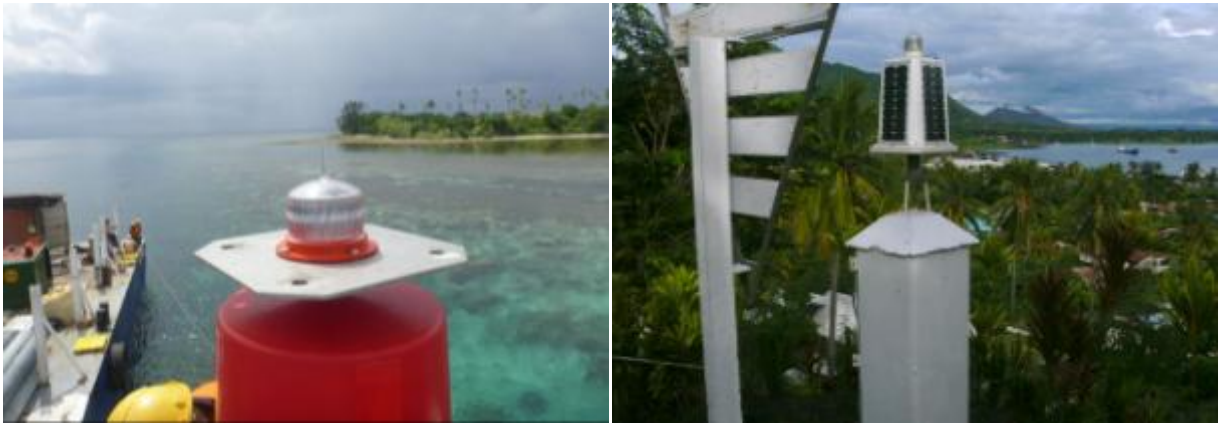
Figure 10 Examples of Use of Self-Contained Lanterns