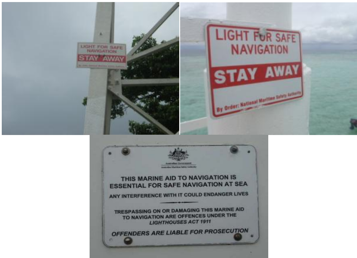
Figure 9 Examples of signage