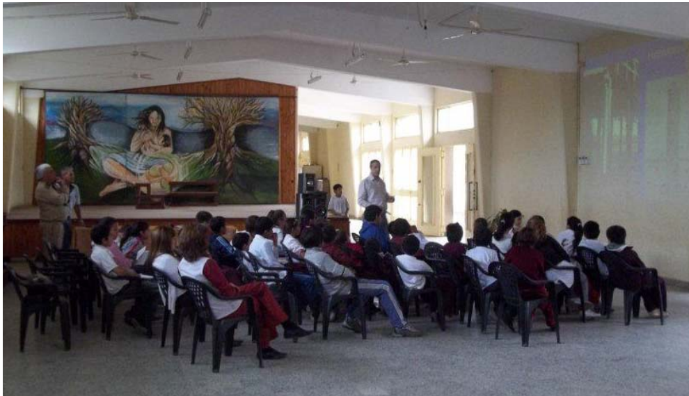
Figure 13 Example of public presentation of the importance of local aids to navigation system.