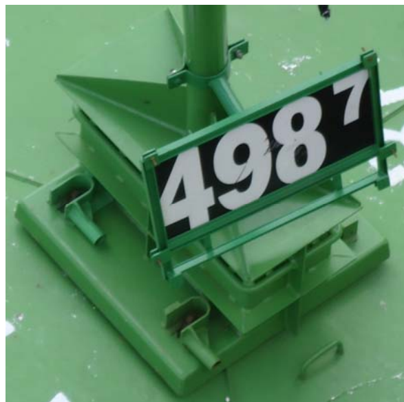
Figure 4 Example of special device to lock super-structure