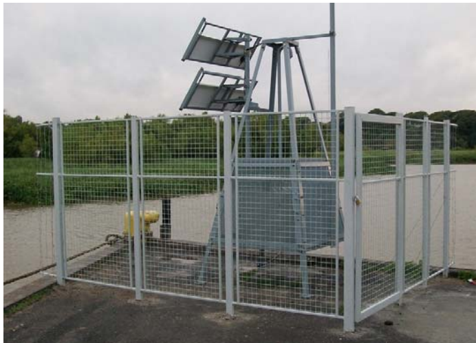
Figure 3 Example of meteorological station protected by a fence