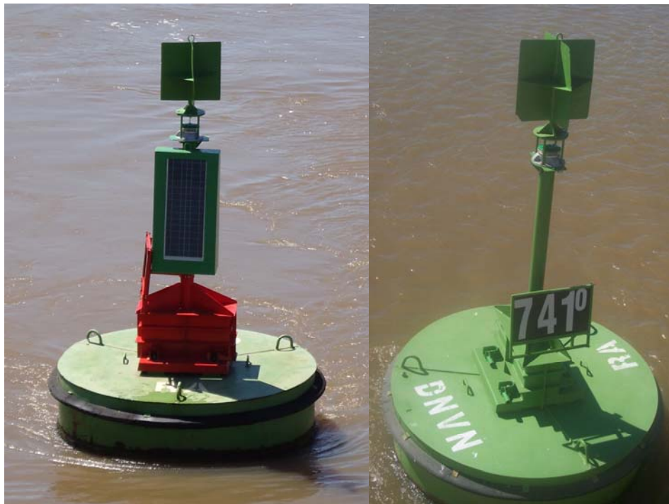
Figure 7 Examples buoys with robust steel battery boxes and solar panel.