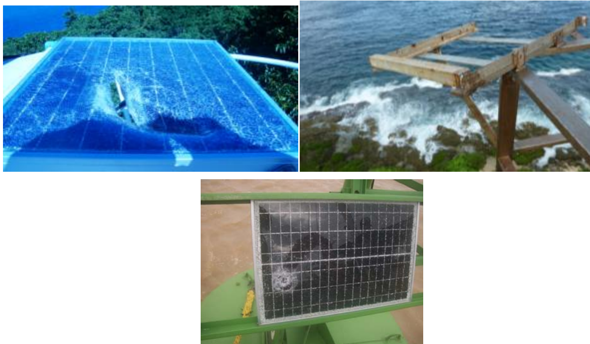
Figure 1 Examples of damage, theft and gunfire to AtoN