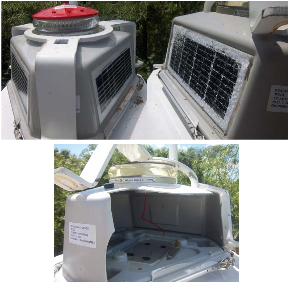
Figure 12 Examples of AtoN where mechanical protection has failed.