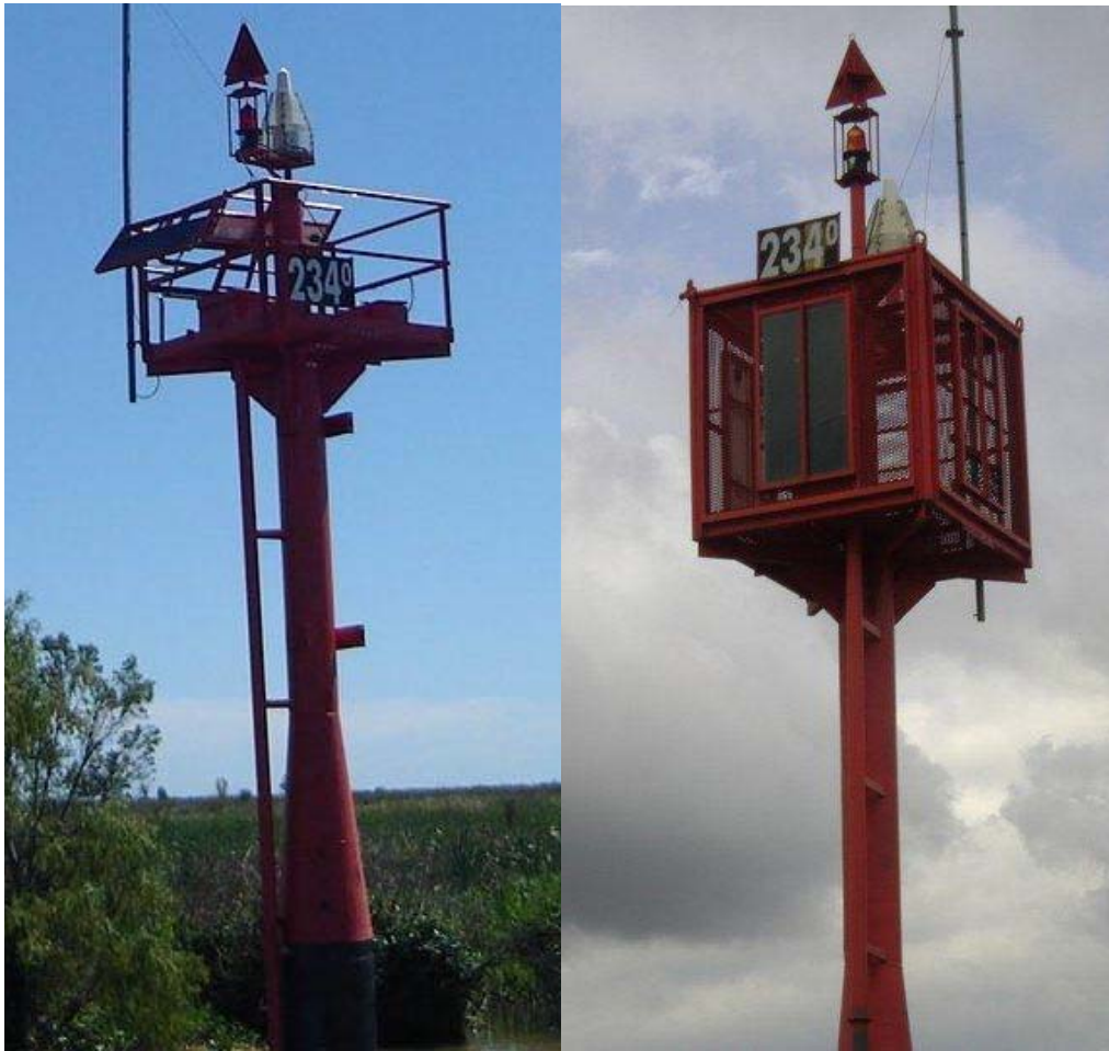
Figure 5 Examples of beacon protected access