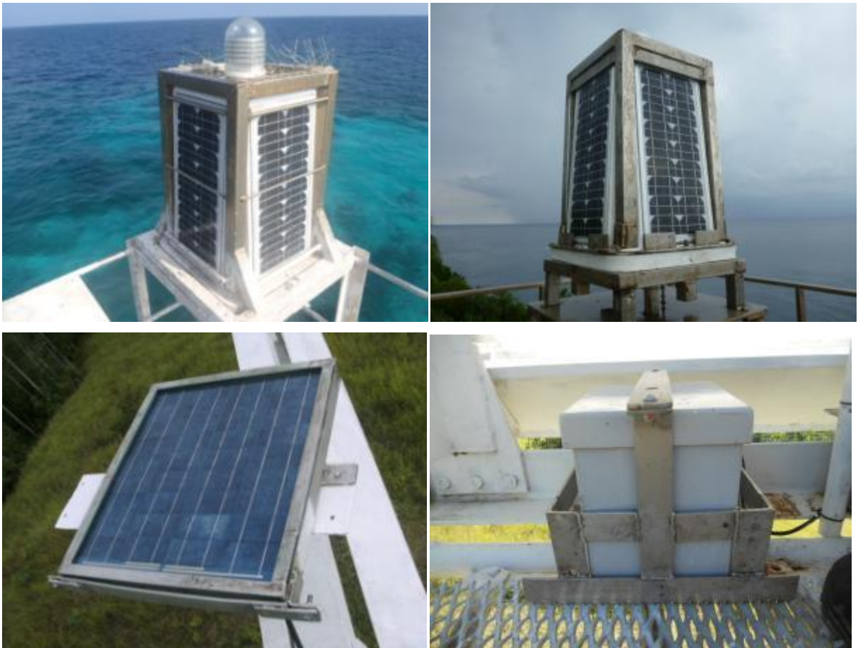
Figure 11 Examples of engineered methods of theft deterrents, including fabricated stainless steel security frames for batteries, solar panels and lanterns.

The use of retrofitted engineering solutions for the prevention of theft may be required at sites where self-contained lanterns may not provide the required range and also where remote monitoring or other methods of surveillance and notification of theft are not possible.