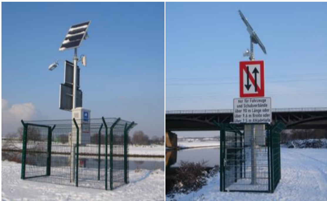
Figure 6 Examples of security and signage