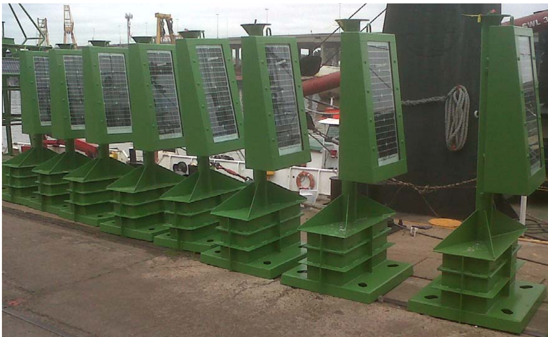
Figure 8 Buoy super-structures with solar panel protected by an impact resistant glass inside a steel box.